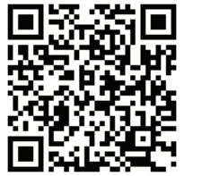
Installation Guide (NVIDIA)