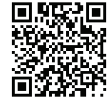
Installation Guide (AMD)