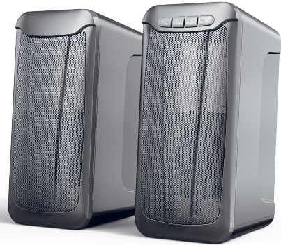
T15 USER MANUAL